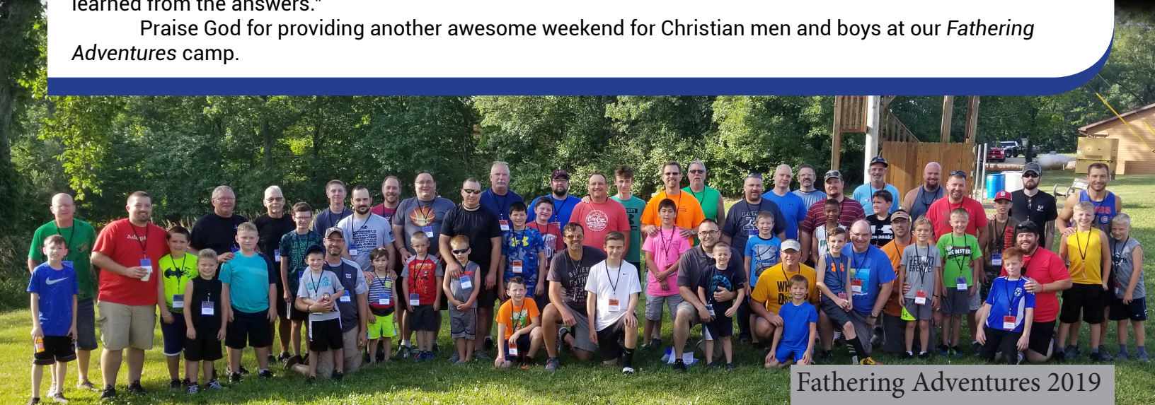
Fathering Adventures 2019

November 7 1st United Methodist Church Springfield IL