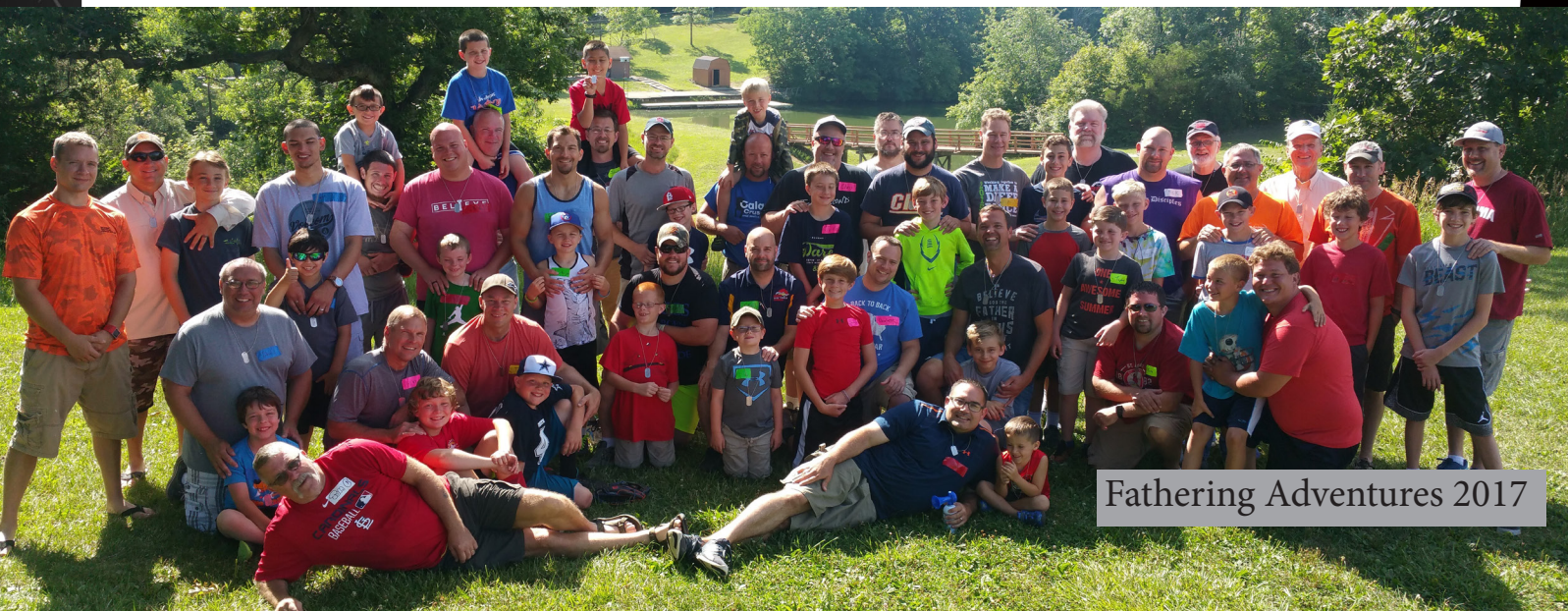
Fathering Adventures 2017